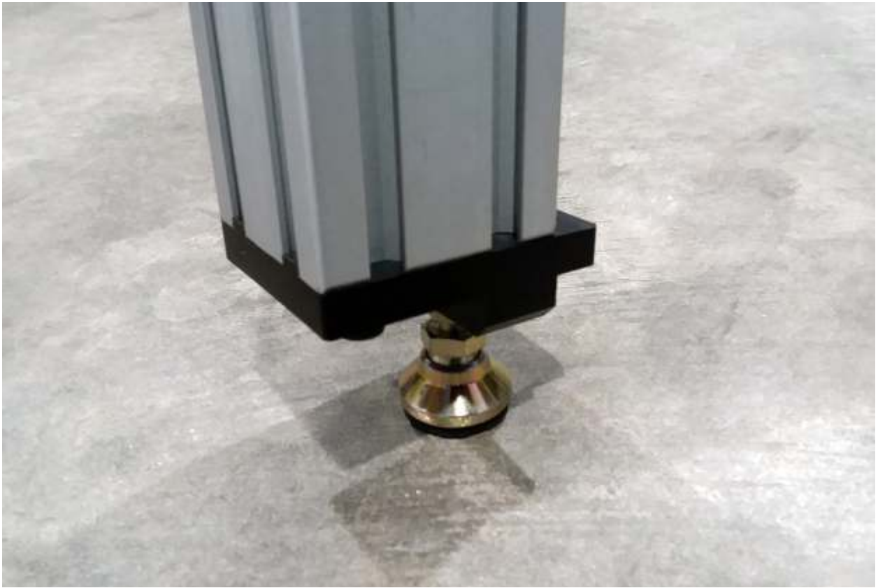
Detail of the adapter plates