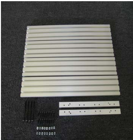
(V90 T-Slot Table Shown)